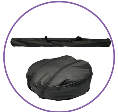
QTY 2: Travel Bags