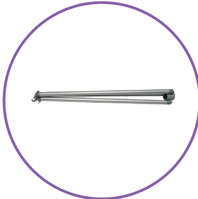
QTY 1: Support Legs