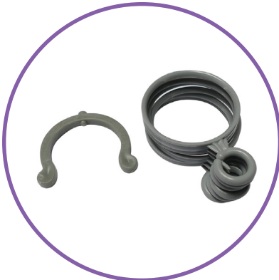
QTY 9: Ring Clips