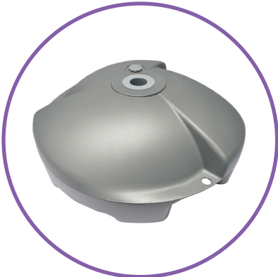
QTY 1 Base