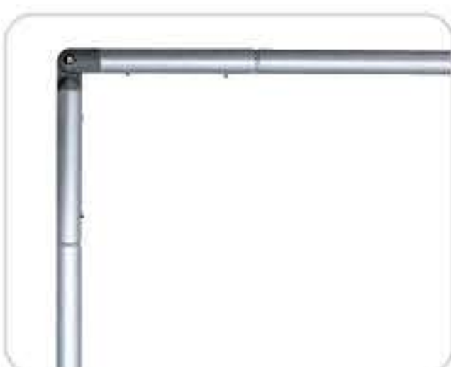
Square Corner Frame

By replacing the corner connectors, you can change the style of the round tube frame's corners.