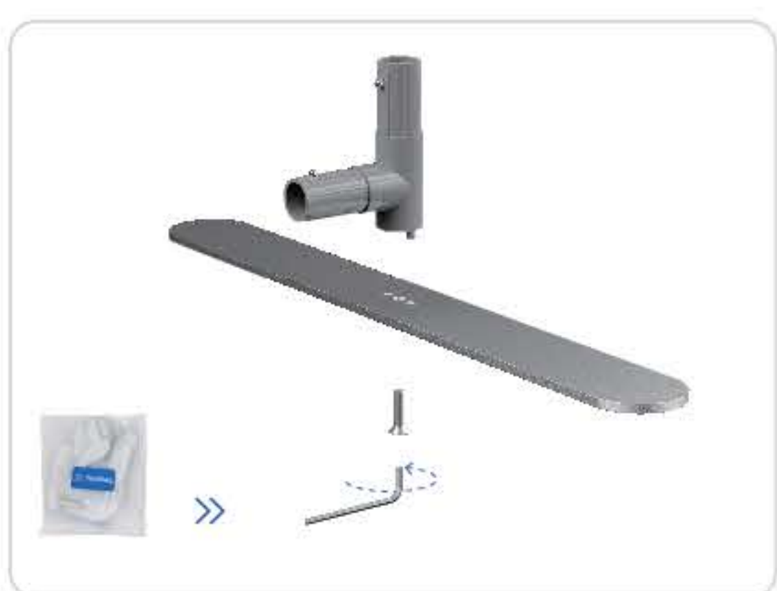
Plate Base Assembly

Use the hex wrench and screws provided in the packaging to assemble the base. Once the base is assembled, connect it to the other round tubes.