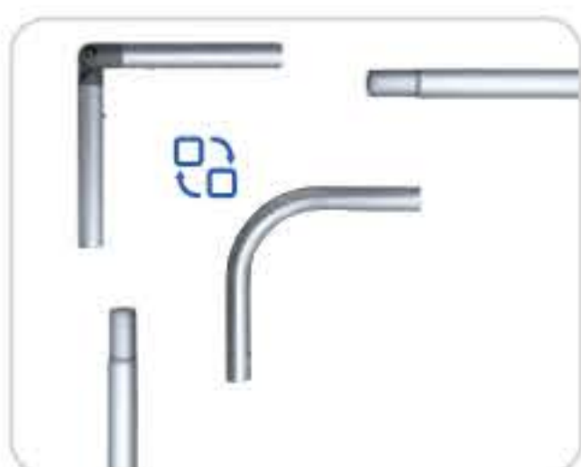
Replace Corner Connectors