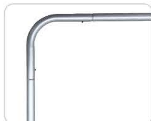
Round Corner Frame