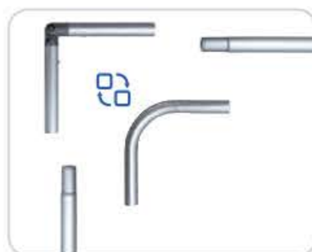
Replace Corner Connectors