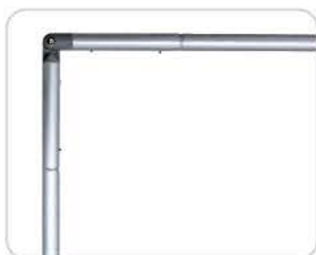
Square Corner Frame

By replacing the corner connectors, you can change the style of the round tube frame's corners.