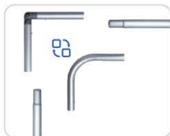
Replace Corner Connectors